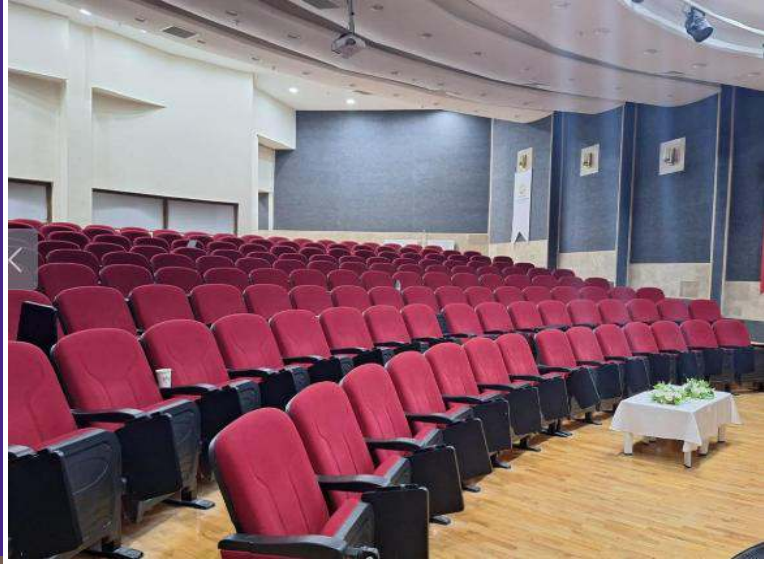
Second hall for parallel sessions

But the venue is only part of the story. The heart of the preparations lies in the dedicated team at Selçuk University, whose enthusiasm and professionalism are already shaping the spirit of the Congress.