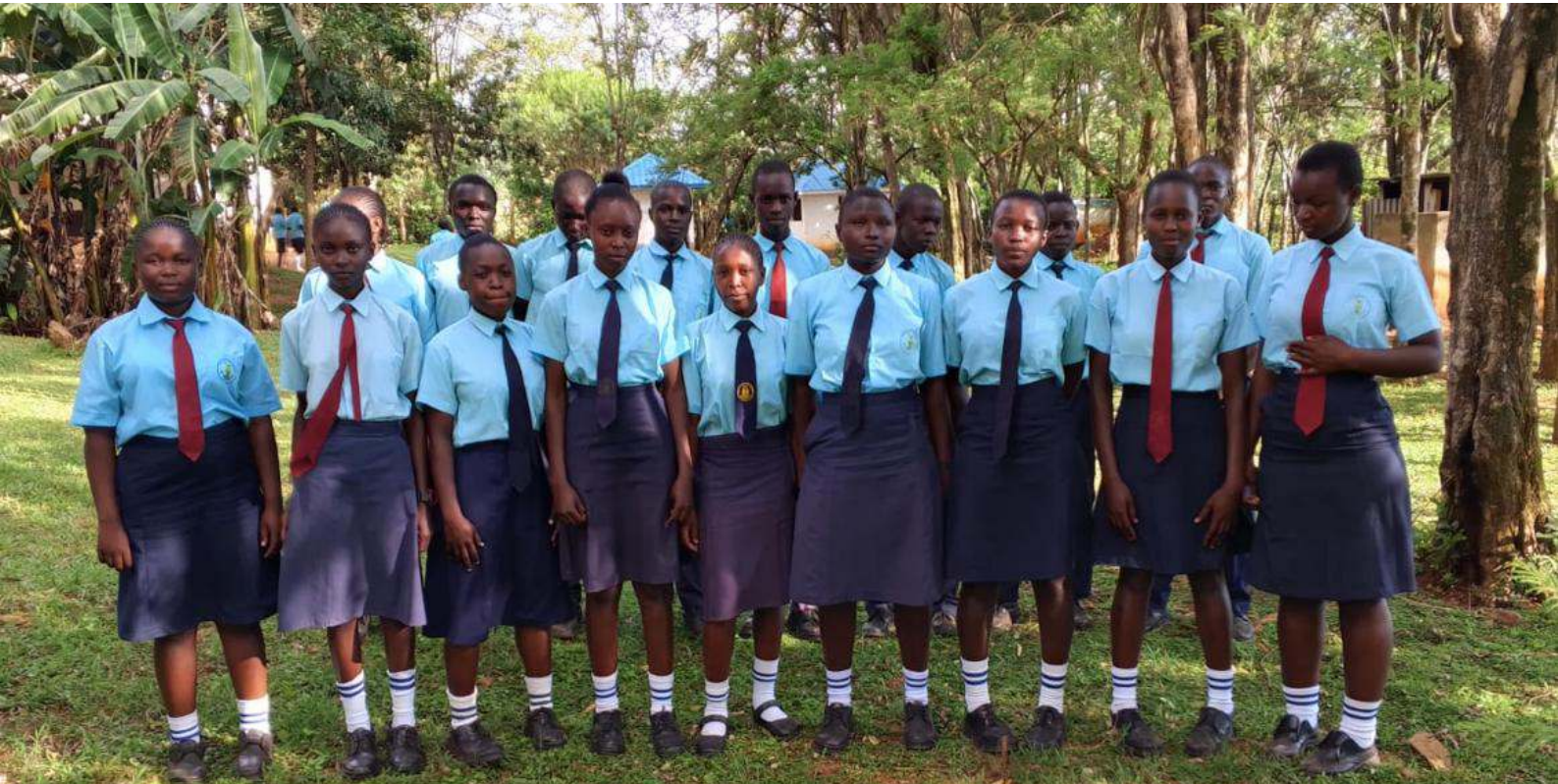
GHI Food Safety Club - Kenya members from Ojola Secondary School in Siaya County western Kenya

We are thrilled to welcome this new Club into the GHI family and look forward to seeing its impact grow.