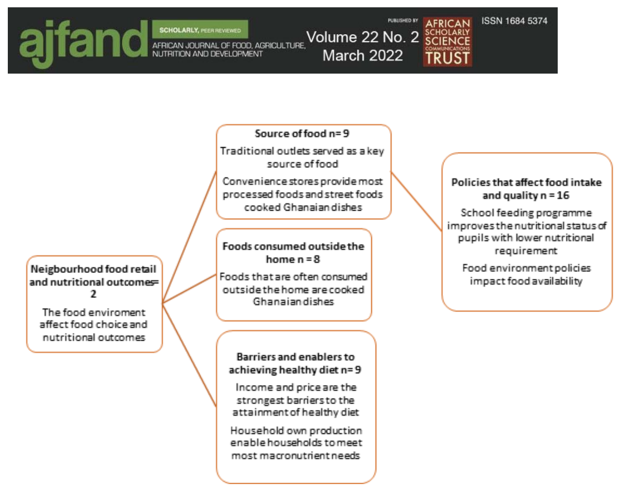
Figure 3: Conceptual framework of Ghana's food environment review findings