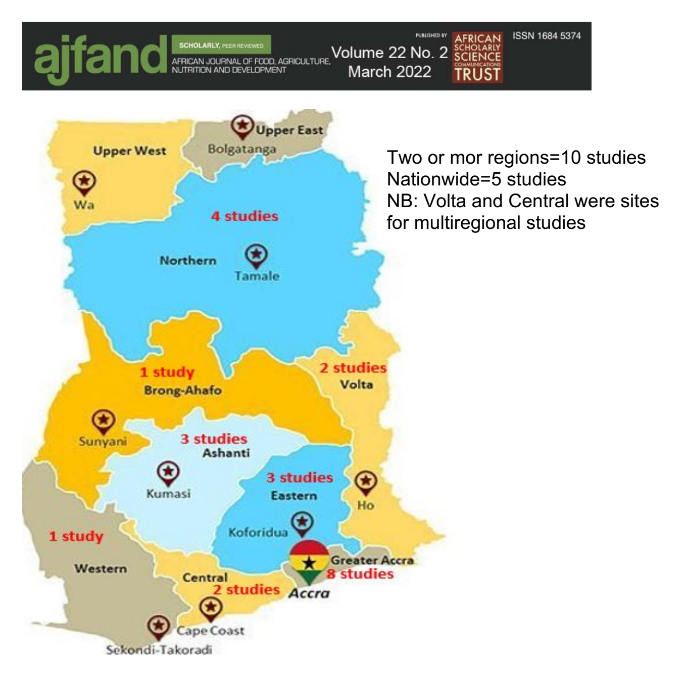
Figure 1: Regional distribution of selected studies