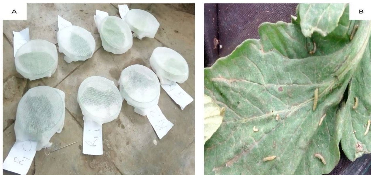
Plate 1: Testing lethal dosage of Belt insecticide on tomato leaf miner larvae A) Covered petri dish sprayed with Belt B) Dead larvae of tomato leaf minor on tomato leaf

Foliar spray method: SnowBecco was used at different concentrations to determine the minimum lethal concentration for effective control of white flies. The recommended concentration of SnowBecco insecticide, that is 400 mg/l (8 g/20 liters), was used as reference while distilled water was used as control. A series of concentrations were used in the diluted dosage and an overdose to form the following concentrations: 0 mg/l, 200 mg/l, 400 mg/l and 600 mg/l. Ten (10) ml of each concentration was sprayed on two tomato plants kept in separate cage (Plate 2), and allowed to dry for one hour prior to infestation with twenty (20) white flies. The experiment was observed after 12 hours for 24 hours period.