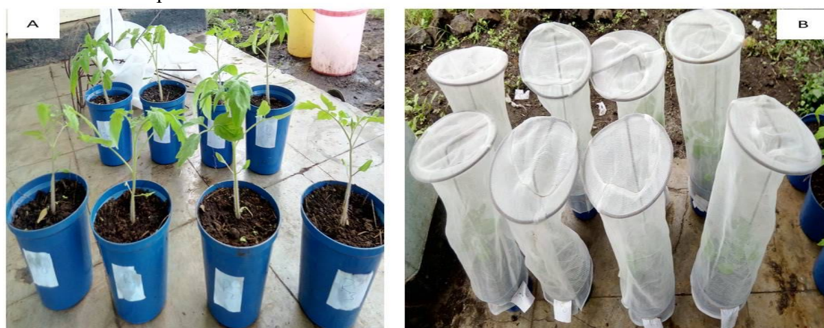
Plate 2: Testing for minimum lethal dosage of SnowBecco on white flies A) Sprayed un-infested tomato seedlings (uncovered pots), and B) Sprayed and infested tomato seedling (covered pots)

Foliar spray method: SnowBecco was used at different concentrations to determine the minimum lethal concentration for effective control of white flies. The recommended concentration of SnowBecco insecticide, that is 400 mg/l (8 g/20 liters), was used as reference while distilled water was used as control. A series of concentrations were used in the diluted dosage and an overdose to form the following concentrations: 0 mg/l, 200 mg/l, 400 mg/l and 600 mg/l. Ten (10) ml of each concentration was sprayed on two tomato plants kept in separate cage (Plate 2), and allowed to dry for one hour prior to infestation with twenty (20) white flies. The experiment was observed after 12 hours for 24 hours period.