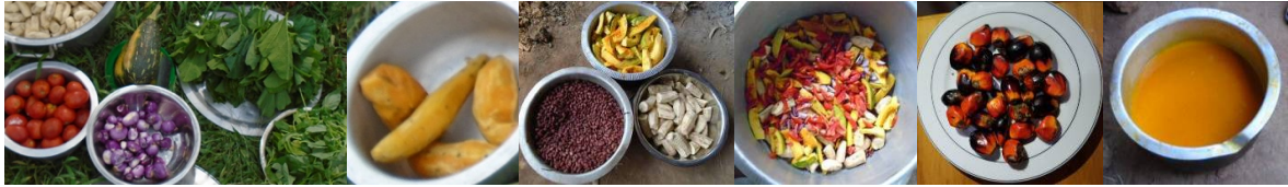
Some food items (ingredients) used to prepare the modified dishes