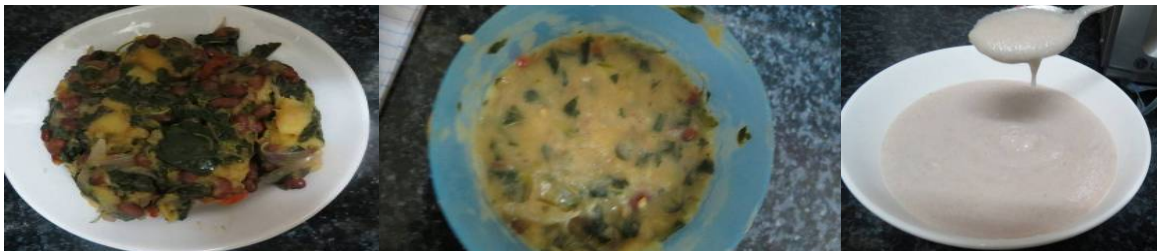
Recipe 1N: 'katogo' for child aged between 12-23 months and adult