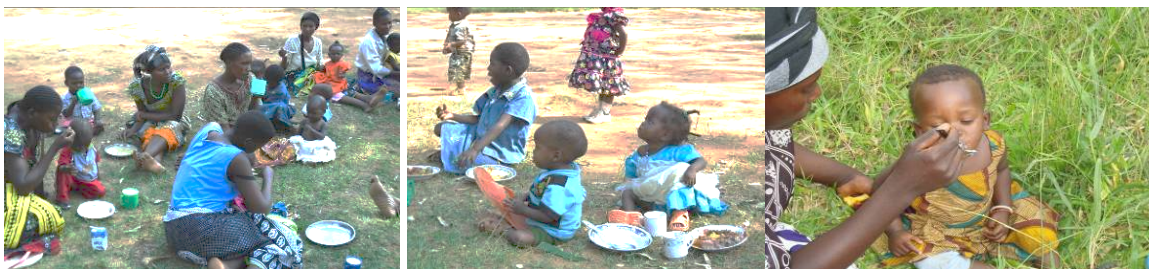
Mother child pair eating after recipe preparation