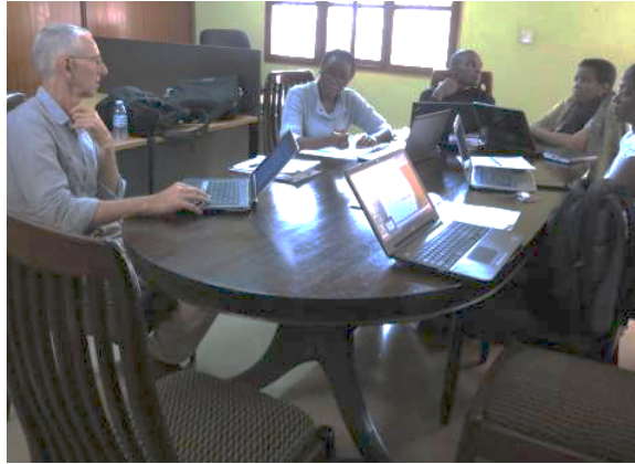
Discussion with nutritionists on diet modification