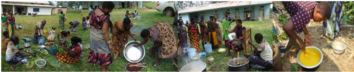
Mothers participating in the preparation of the modified and new dishes