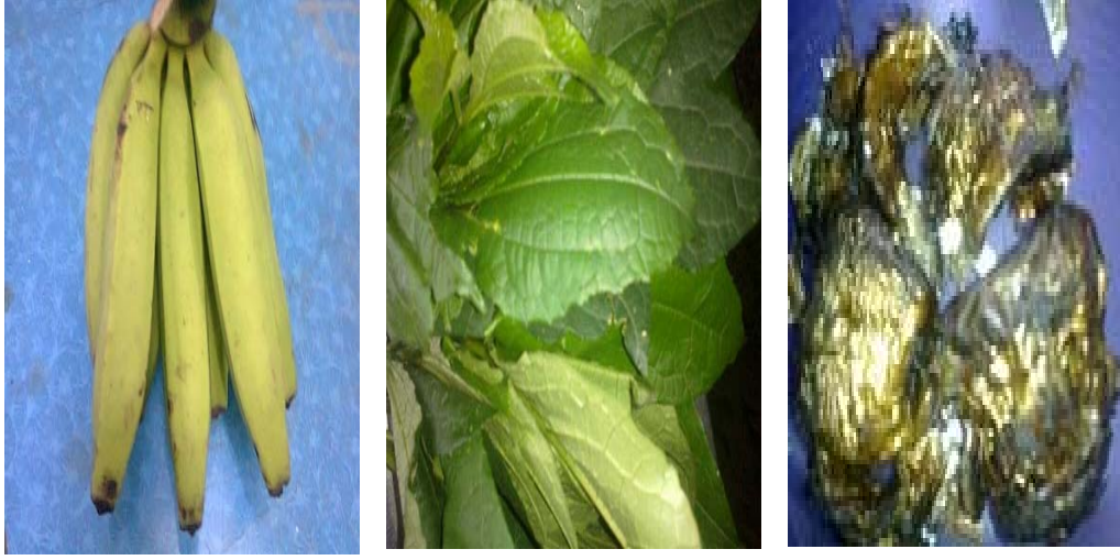
Figure 1: (A) Banana fingers

The standardised CFs were very low in anti-nutrients (Table 4). Tannins and trypsin inhibitors were undetected at milligram level in Samples 1 and 2 while phytates and saponins were present at trace levels in the two samples. Sample 1 had the highest value of oxalates, sample 2 was highest in phytate content while sample 4 was highest in trypsin inhibitors. There were significant differences in values of the anti-nutrients in the complementary foods (p<0.05).