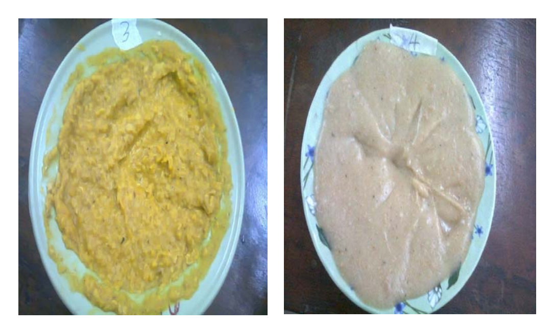
Figure 3: Mashed bean porridge (Sample 3)