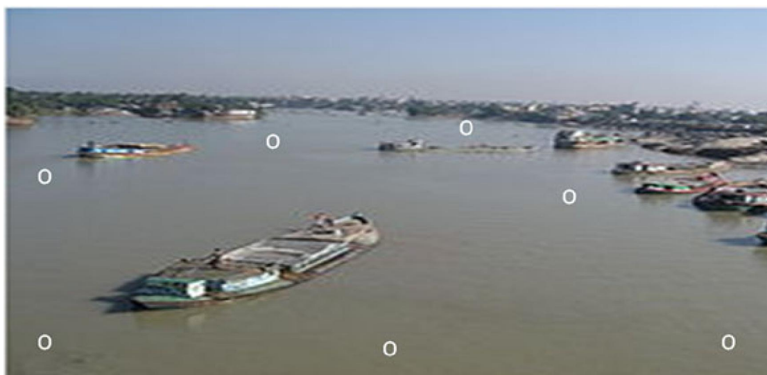
Plate 1: Bangsai river of Bangladesh (near Savar). O Fish samples collection spot

To assess the precision of these methods, standard solution of anthracene was determined six times on the same day and over a six-day period. The results showed good precision. The accuracy of the method was evaluated through recovery studies. The recovery experiments were performed at three concentrations (1, 2 and 5 ng) of the standard added to sample solutions, in which the marker content had been determined, using a sample from the most polluted part of Bangsairiver. The results for the recoveries of anthracene were in the range of 71–85.32 %. The limit of detection (LOD) of the GC-MS method, established at signals three times that of the noise for anthracene was 2.5 ng.