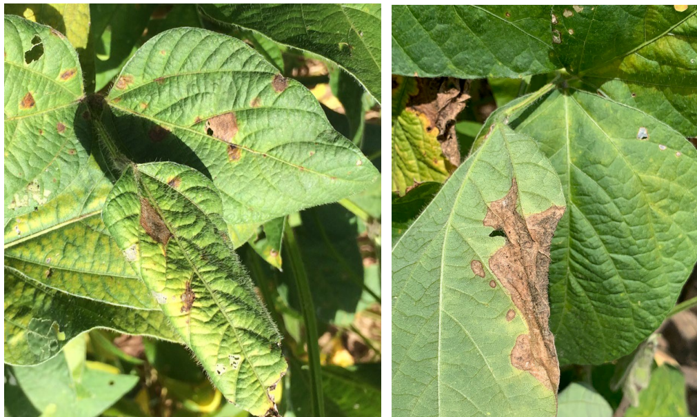
Figure 2: Myrothecium leaf spot on soybean caused by Paramyrothecium roridum with brown leaf lesions about 0.3 to 0.7 cm in diameter (left) and bacterial tan spot caused by Curtobacterium flaccumfaciens pv. flaccumfaciens with marginal necrosis (right)