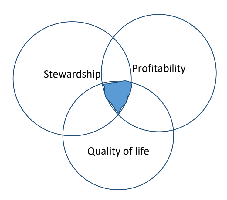
Figure 2: Illustration of the relationship between the three pillars of sustainable agriculture

This leaves us with the need to understand the principles of sustainable agriculture as the most appropriate approach towards defining it. According to Sustainable Agriculture Research and Extension (SARE), there are three underlying pillars with regard to sustainable agriculture [16]. These are stewardship of natural resources, profitability of farm business and quality of life, as illustrated below (Figure 2).