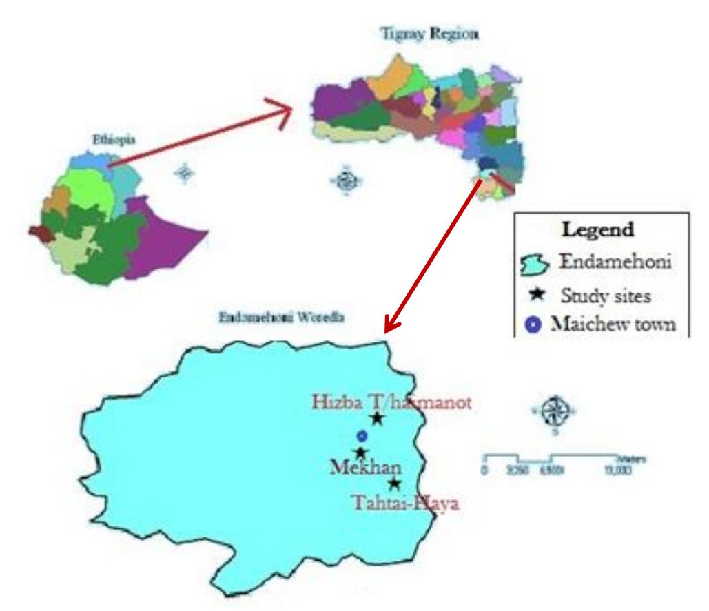
Figure 1: Location of the study area (Endamehoni District, North Ethiopia)

The study was conducted in Endamehoni District, northern Ethiopia (Fig. 1). The District has an estimated total population of 84,726, of whom 2,985 (3.5%) are urbandwellers [13]. It is divided into 18 "Tabias" (local administrative units of the district) and 70 sub-Tabias. The district is situated at an altitude ranging between 1700 and 3488 masl. The rainfall is bimodal, the Kremt season (June – September) and Belg season (January – March). The temperature varies from 6°C to 32°C [14]. Agricultural production, particularly mixed farming is the basis for the livelihoods of the people in the district and it is rainfed, relying on the Belg and the Kremt rains. Wheat and Barley are the main food crops, while Sorghum, Teff, Maize and Faba Bean are minor food crops. Pulses are the main cash crops. Natural pastures, cereal straws and Cactus (locally called Beles) are the major forages. The main livestock types are cattle, sheep and goats.